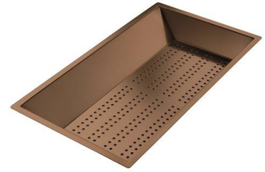
Stainless steel perforated tray PVD Copper

* only in combination with the accessory 8644 101