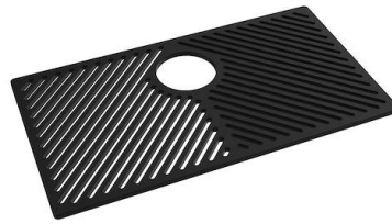
Black grid 8100 653