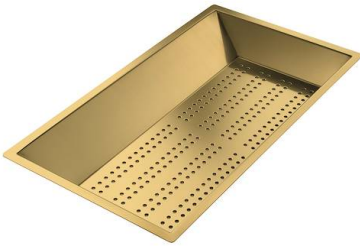
Stainless steel perforated tray PVD Gold

* only in combination with the accessory 8644 101