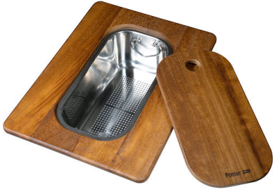
Iroko-wood sliding chopping board with stainless steel colander