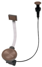
Space Push Copper automatic waste fitting